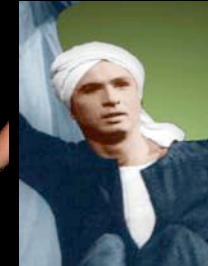
Mahmoud Reda Egypt