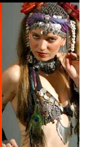
Sera Solstice USA